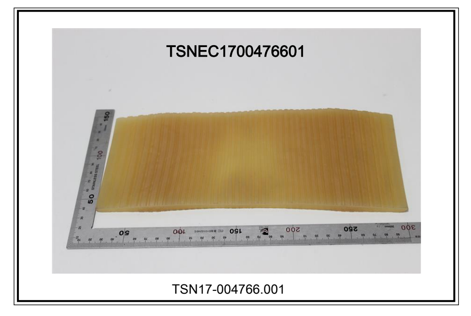
SGS authenticate the photo on original report only